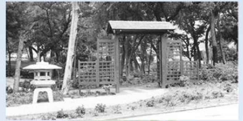
ORIGINAL ENTRY PORTAL KIDD SPRINGS JAPANESE GARDENS