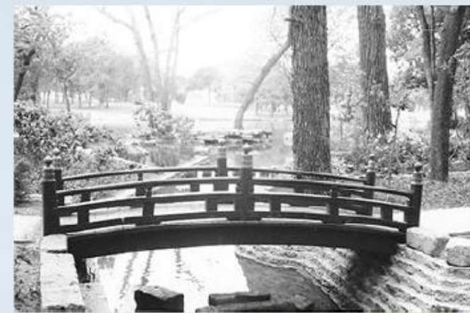
ORIGINAL PEDESTRIAN BRIDGE KIDD SPRINGS JAPANESE GARDENS